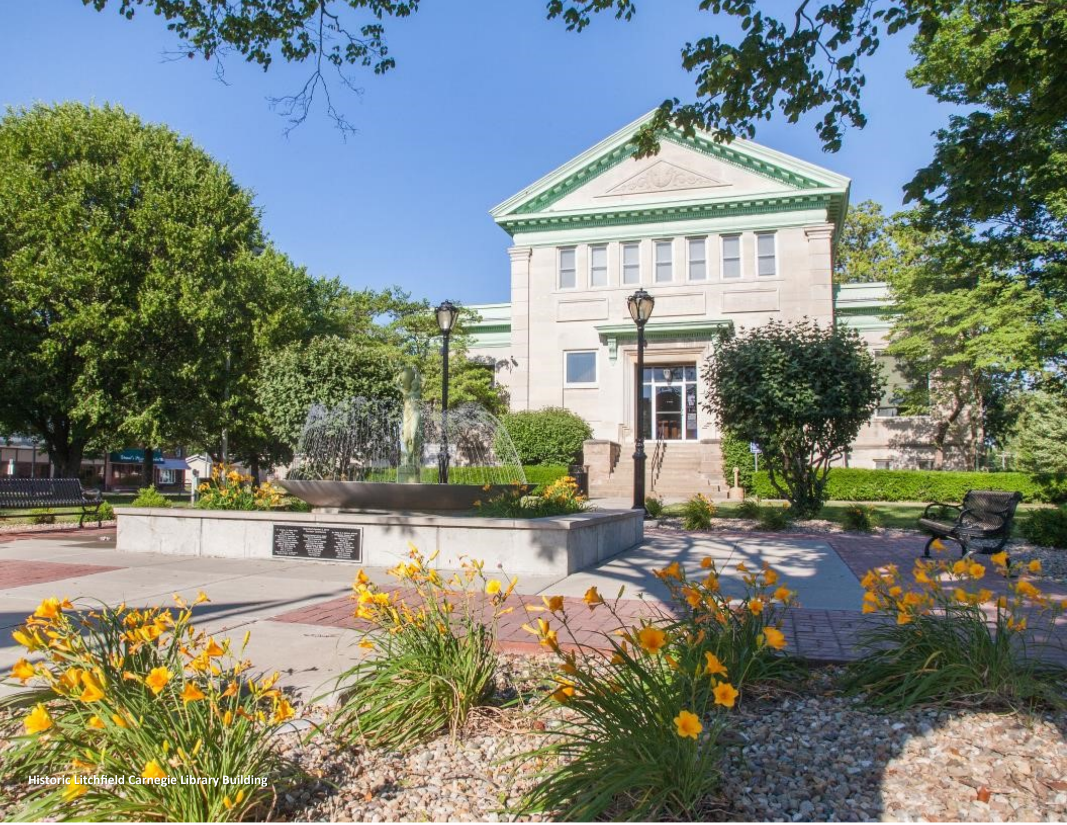
Historic Litchfield Carnegie Library Building