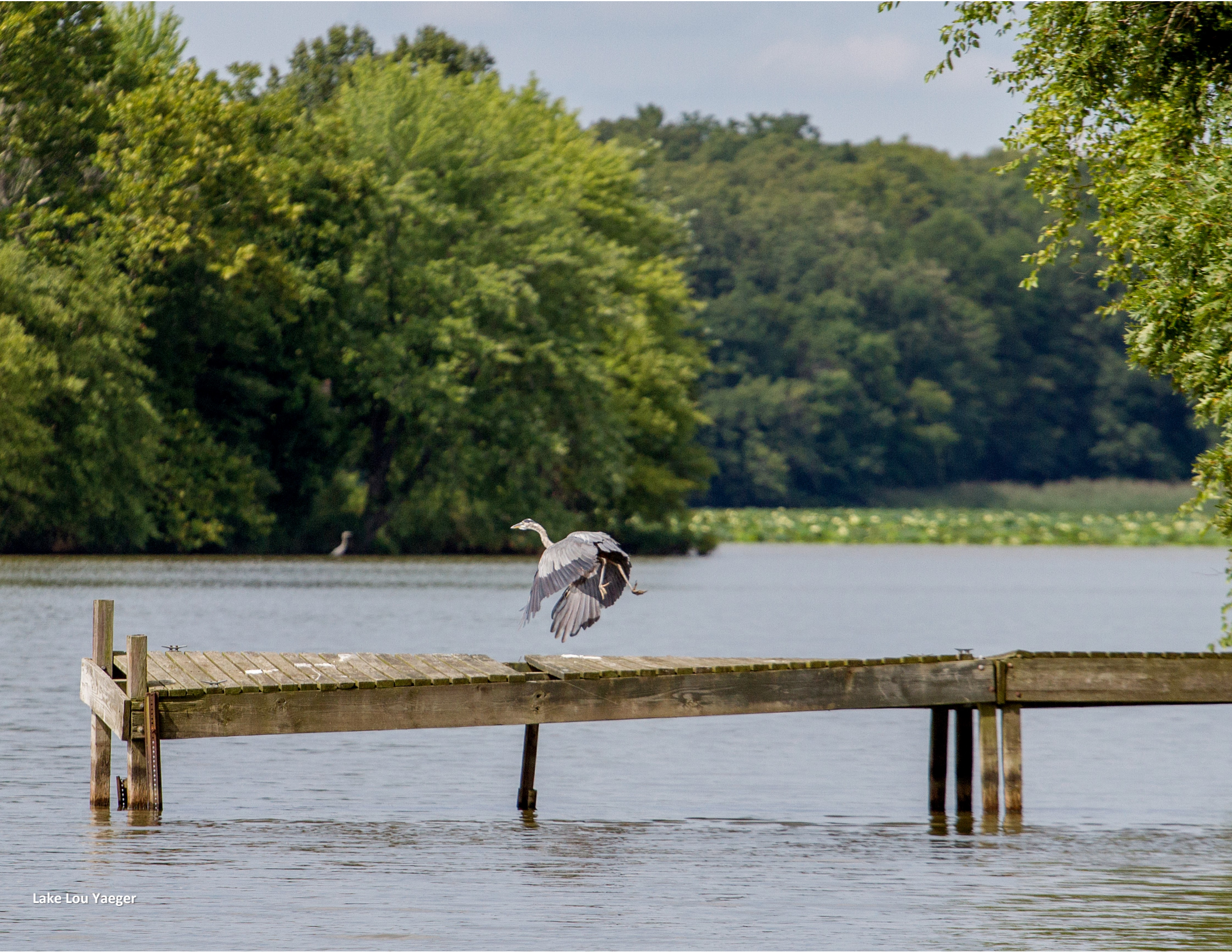
Lake Lou Yaeger