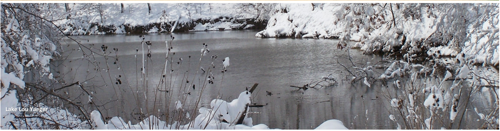
Lake Lou Yaeger