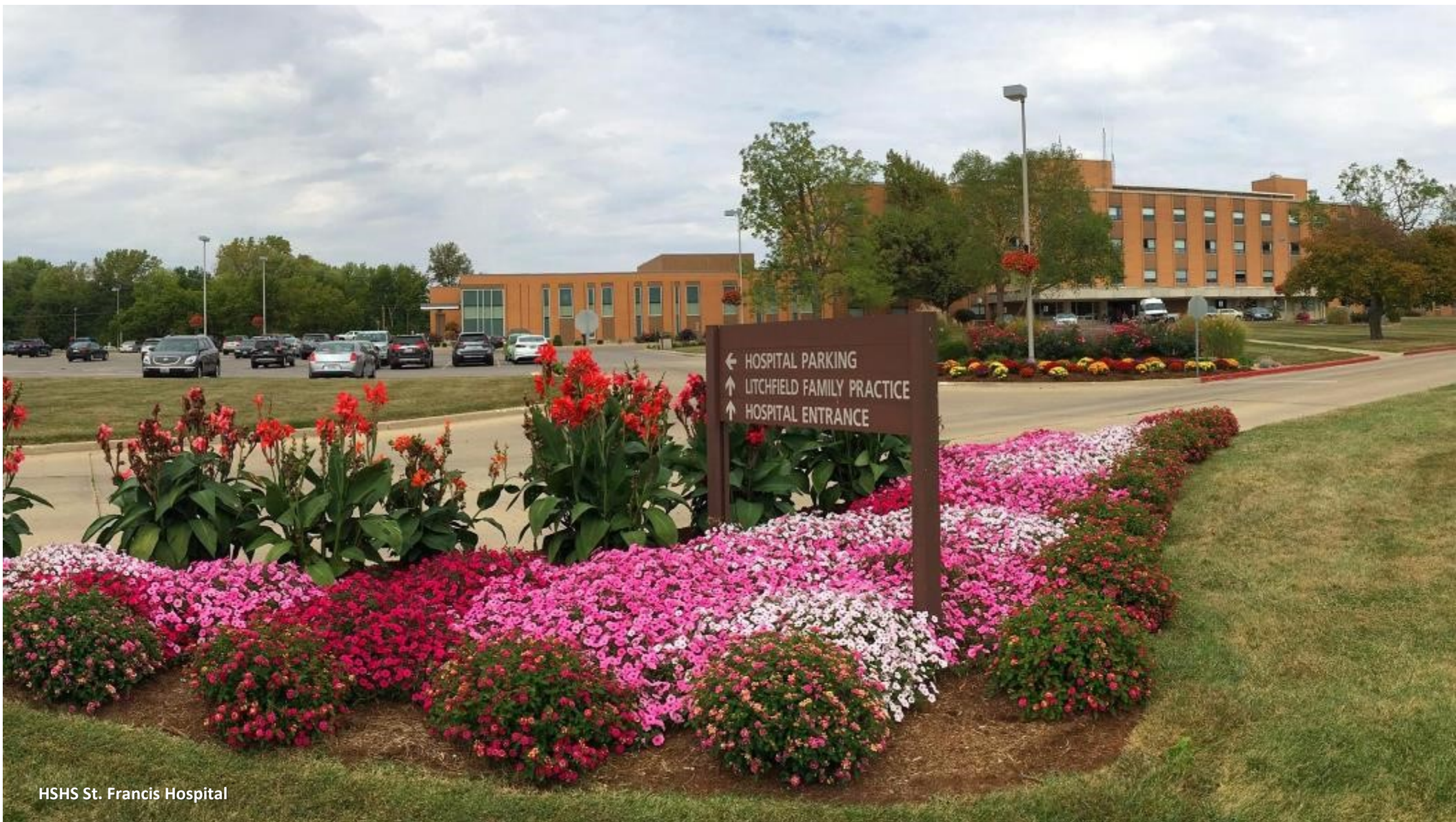
HSHS St. Francis Hospital