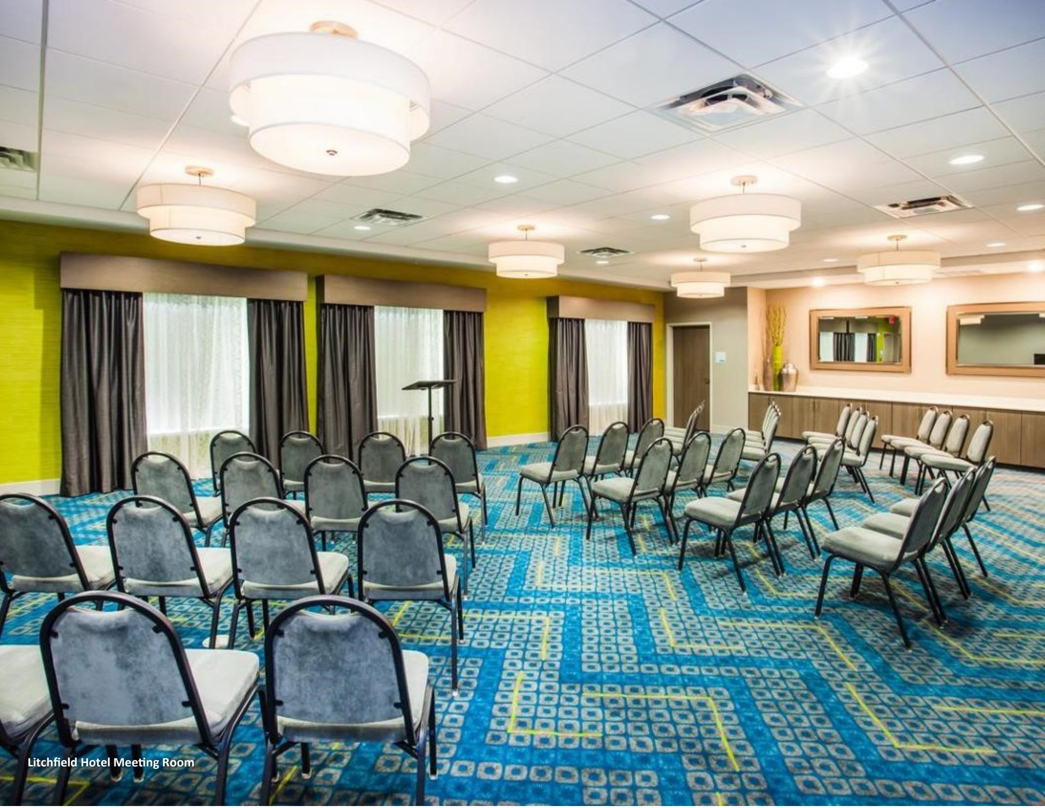
Litchfield Hotel Meeting Room