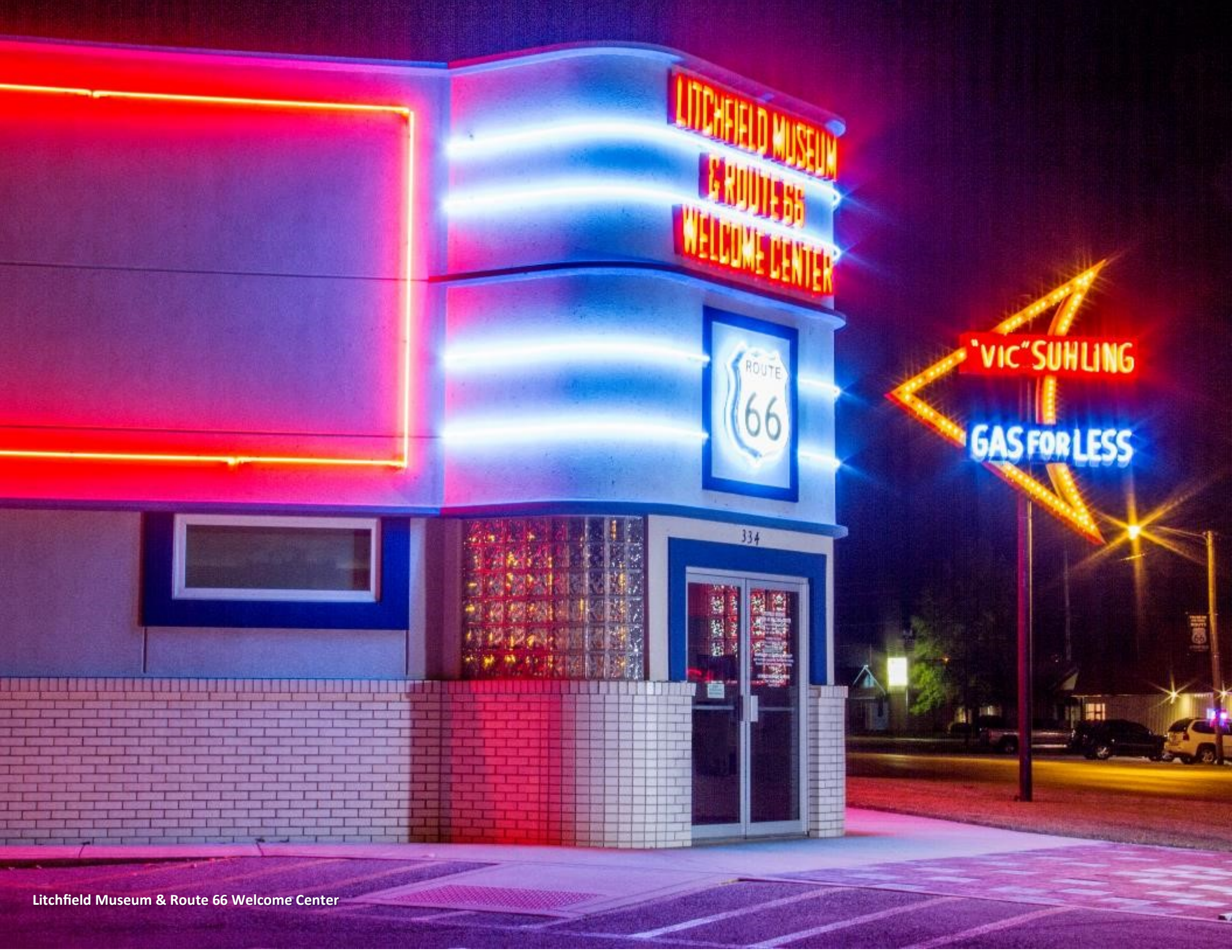
Litchfield Museum & Route 66 Welcome Center