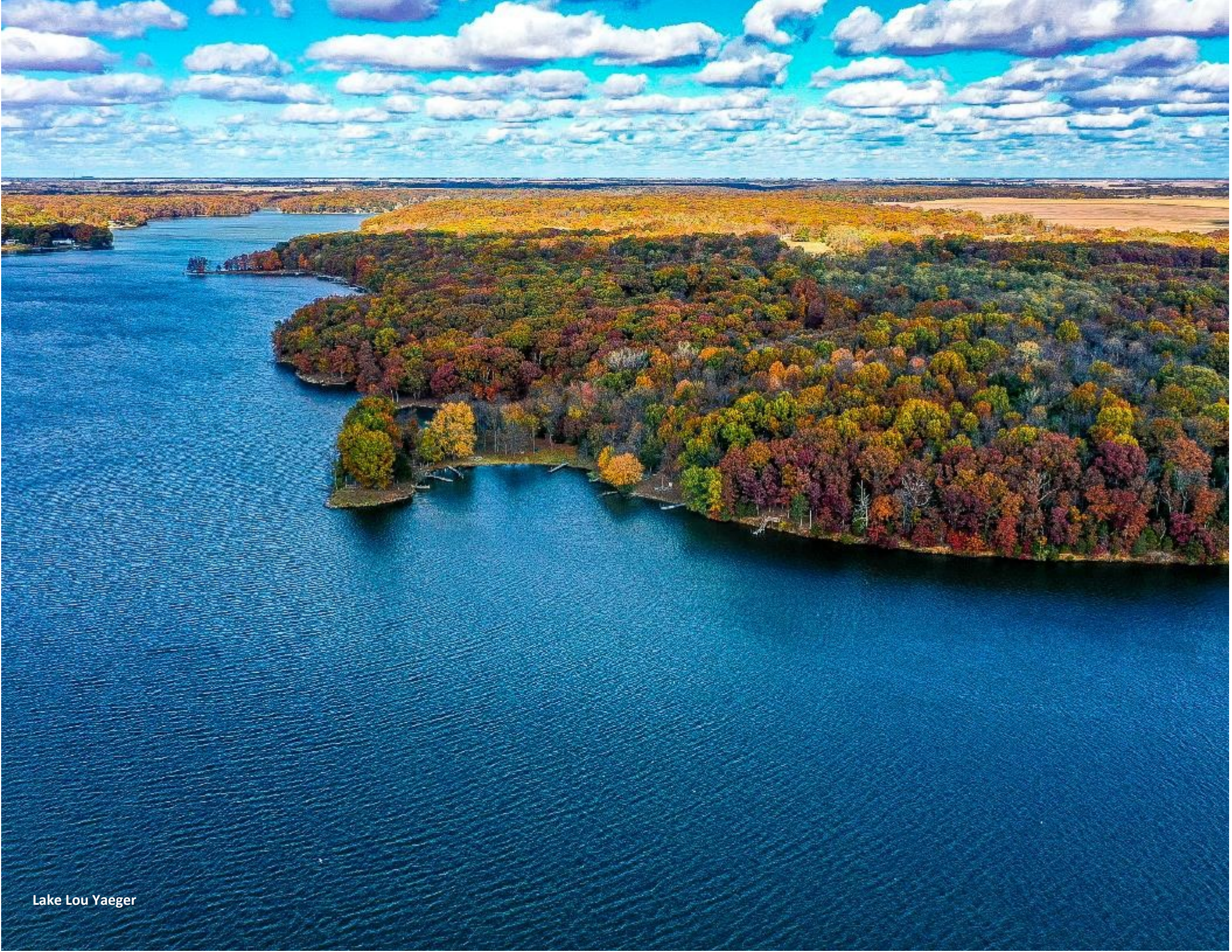
Lake Lou Yaeger