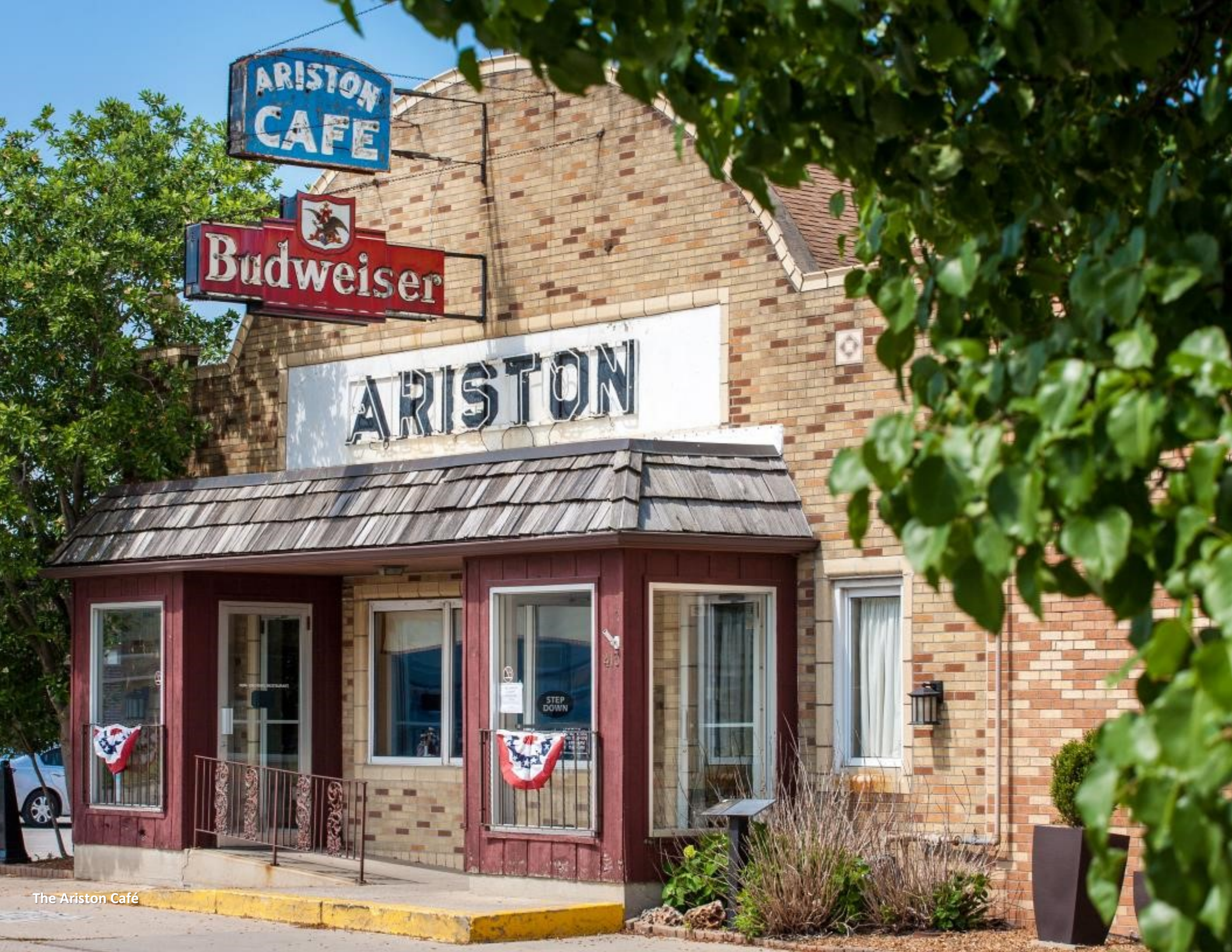
The Ariston Café