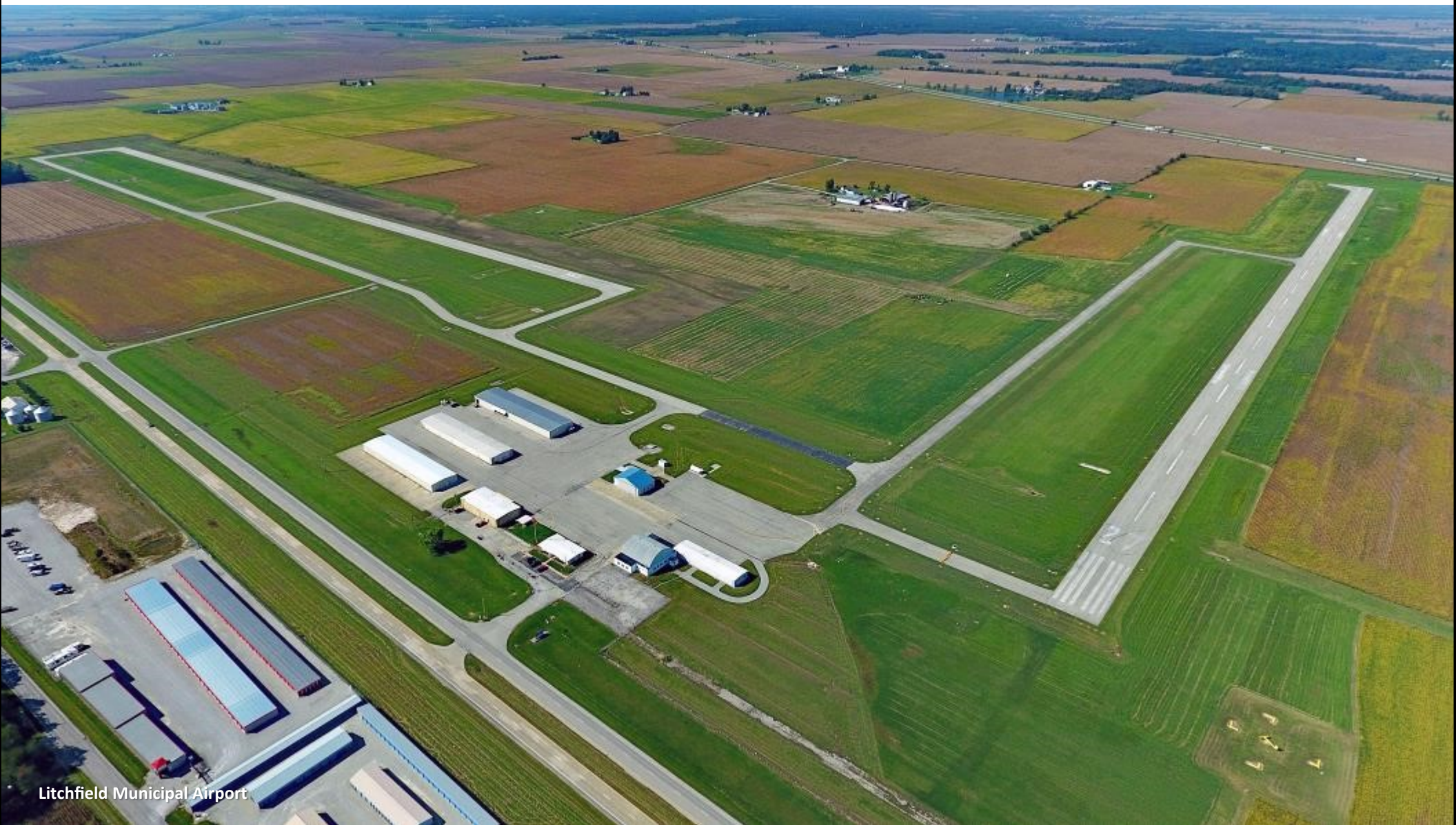
Litchfield Municipal Airport